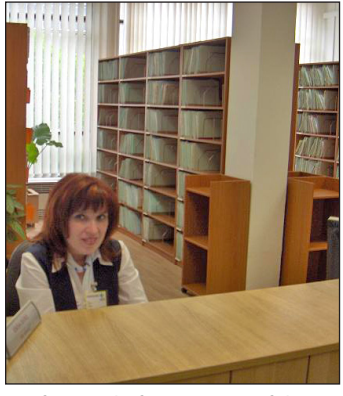
Before and after pictures of the Model Court in Zenica.