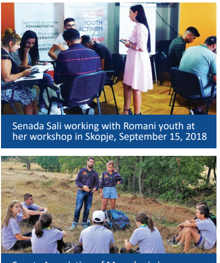
Scouts Association of Macedonia in their new uniforms September 2018

enhanced the visual identity of all Scouts and increased the sense of belonging and team spirit among Scout peers. The Scout Association of Macedonia equipped 300 Scouts with brand new uniforms, as they continued with their mission of guiding