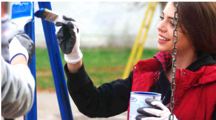
Keep Gostivar Clean action

Aiming to achieve increased and sustained youth engagement in Macedonia, CEP awarded Association for Democracy Advancement – Democracy Lab a youth engagement support grant to implement the “ImpACT” project. The project takes an innovative approach to empowering youth civic engagement through the use of technology and collaboration with CSOs throughout Macedonia. Through this project, the grantee created an e-toolkit that serves as a one-stop-shop for youth community efforts. The platform offers resources and tools ranging from webinars on project design management, volunteer opportunity maps, and different project ideas, in both Macedonian and Albanian languages. The project ideas are organized according to the 6 United Nations Sustainable Development Goal categories: health, environment, education, poverty and hunger, human rights, and community building. Moreover, the grantee in cooperation with four partner organizations (Youth Center Kreative – Kavadarci, Youth Development Organization Faktor –