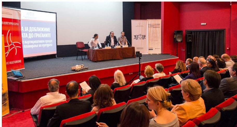
"How to Bring Culture Closer to Every Citizen" - Policy Forum

CEP's first Annual CSO Week took place during the week of 11-17 September 2017. CEP designed this innovative activity with the aim of promoting and celebrating the achievements of citizens and CSOs and to provide a venue for national CSOs and CSO alliances, including youth CSOs, to present and discuss their work with citizens and encourage them to participate in CEP-supported initiatives. The activities included coordinated events in 12 different cities in Skopje, Strumica, Tetovo, Lipkovo, Kavadarci, Struga, Delcevo, Sveti Nikole, Bitola, Krusevo, Gostivar, and Kicevo. In order to organize this activity successfully, CEP worked in partnership with 17 different CSOs across the country, and involved more than 1,400 citizens and representatives from the private sector, government, and academia that participated in 21 different events such as debates, a youth camp, exhibitions, CSO anniversaries, international conferences, open-air promotional events, concerts and a policy forum.