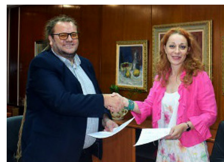
Signing the Letter of Intent for Strategic Support by the Minister of Culture and the Chief of Party of USAID's Civic Engagement Project

Cooperation. The LoI stipulates a mutual commitment to working together to develop programs that promote and enhance civic participation in strategic documents related to culture and to incorporate public input in key Ministry initiatives, such as the draft 2018-2022 National Cultural Strategy and the 2018 Annual Plan on Culture. Below you can find more on the very first Policy Forum we organized with the support from the Ministry in September, 2017.