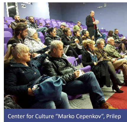
Center for Culture "Marko Cepenkov", Prilep

public debate on December 27, 2017 in the Museum of Contemporary Art in Skopje and presented the revised draft strategy and the first draft of the Cultural Development Action Plan for 2018. Nearly 100 representatives of relevant arts and culture public and private institutions, CSOs, media, and cultural institutions participated and provided their feedback on the two documents. The final version of the strategy is expected to be adopted in February, 2018.